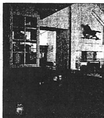
Custom fabrication and installation for countertops, kitchens, baths, foyers, fireplaces and furniture

Design Consultations for Architects, Builders, Home Owners and Interior Designers